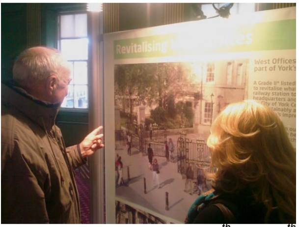
Display in Mansion House 5<sup>th</sup> and 6<sup>th</sup> March

Following a very successful consultation event at the Mansion House in early March, where 400 people attended over the two day event, the developer is now working towards submitting a planning application in April 2010.