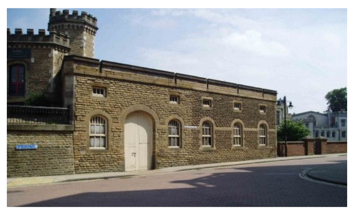
Former electricity sub station Wellington Row which will become cycle point with secure cycle storage

with Bikerescue as part of the successful Cycle City Campaign. The Executive agreed to release £270,000 from the 2009/10 City Strategy Capital Programme to fund the conversion of the building.